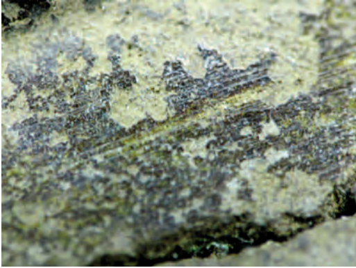
Fig. 5. Grinding striations on the Västervik spearhead (x150).