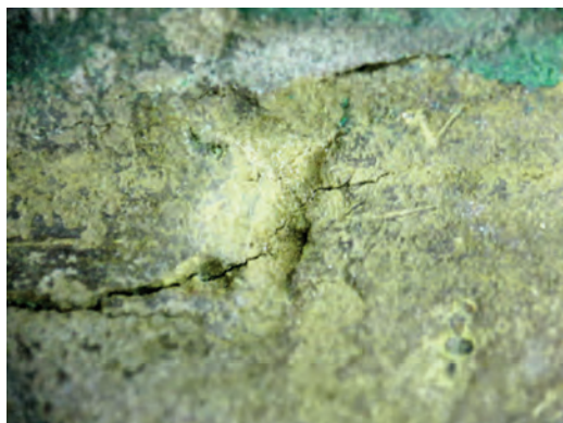
Fig. 3. Possible decoration on the Västervik spearhead (x60).