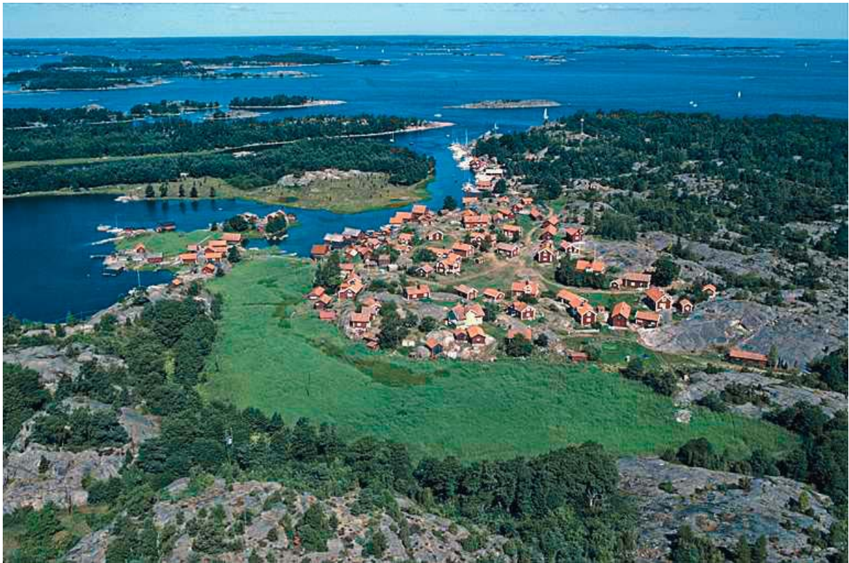
Photo: Harstena island, Östergötland.

tive use of other public or private resources and can result in job opportunities, good living environments and an attractive region. One example worth mentioning is that in 2006, within the frame of the regional growth programme, 39 million Swedish kronor of the above contribution together with around 190 million kronor from the EU, industry, the Swedish Agency for Public Management, other government agencies and private and non-profit actors was made available.