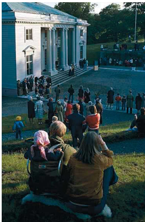
Gunnebo House, Västergötland.

It is the National Heritage Board's responsibility to ensure that the cultural heritage and historic environments are preserved and developed. By means of support,