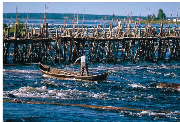
Photo: River Torne at Kukkola.

During the programme period 2007-2013, the National Heritage Board, together with the Swedish Arts Council, the Swedish Film Institute and the National Archives, has been nominated to participate in three of the national supervisory committees. The National Heritage Board contributes with two ordinary members, one for Southern Sweden and one for Northern Sweden.