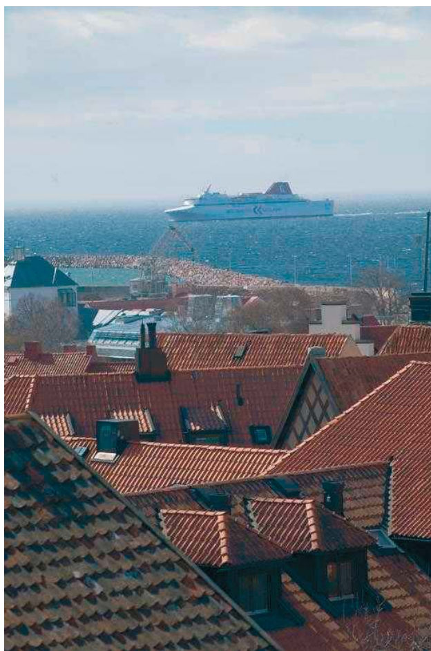
Visby, Gotland.

In the 2002 Appropriation directions, the National Heritage Board was commissioned to account for the way in which its work contributes to and promotes regional development. The report provides a summarised description of the areas of work that in some way contribute to regional development in economic, social and environmental terms.