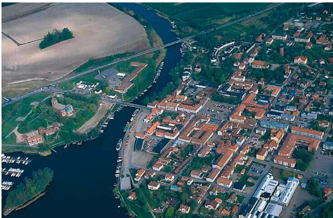
Photo: Askersund town, Närke.

The National Heritage Board has been involved in regional development work for over ten years. This is not only due to the National Heritage Board being a driving force within cultural heritage as an asset in regional development, but also that collaboration with other government agencies and other stakeholders is regarded as a prerequisite for sustainable regional development. The National Heritage Board has tailored its organisation and allocated human resources in order to facilitate its participation in societal processes, including regional development and growth. In its governmental appropriation directions the Board has been required to provide feedback on regional development work. In addition, the Board has been involved in several government commissions designed to strengthen regional development work, the latest being the RUP-uppdraget [RUP-commission], and prior to this the so-called sektorssamordningsuppdraget [sector's coordinating commission].