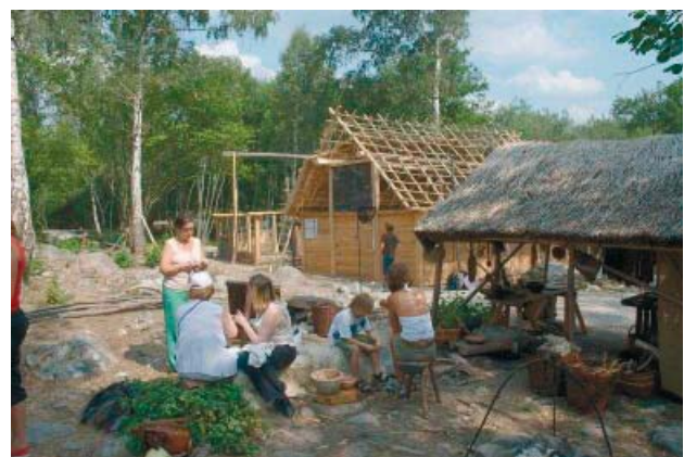
Birka, Uppland.

Today it is clear that the cultural heritage and historic environment have the capacity to attract large numbers of visitors and tourists. The quality of living environments, including urban and rural environments, cultural amenities of various kinds, natural environments and recreation areas are all very important when it comes to attracting people to live in cities and regions. But attractiveness is not only about getting people to visit a place. It is just as important to improve the quality of life for those living there and to provide business opportunities.