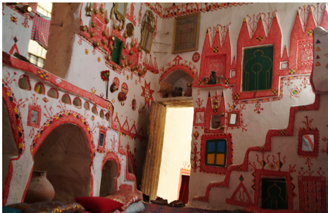
Main Hall, home of Ghadames.

Yet presently, the heritage values in Ghadames and in the Sahara as a whole are currently facing serious challenges due to the limit of protection and the lack of appreciation of heritage planning, conservation and management. This means that the popular concept of their understanding is that “the new” is better. The objective of this presentation is to raise awareness of the heritage values of the adobe architecture in the Libyan Sahara. Consequently, the presentation is considering the modern challenges and providing a discussion for better practices along with the sustainable development perspective for the Libyan Sahara and Ghadames in particular.