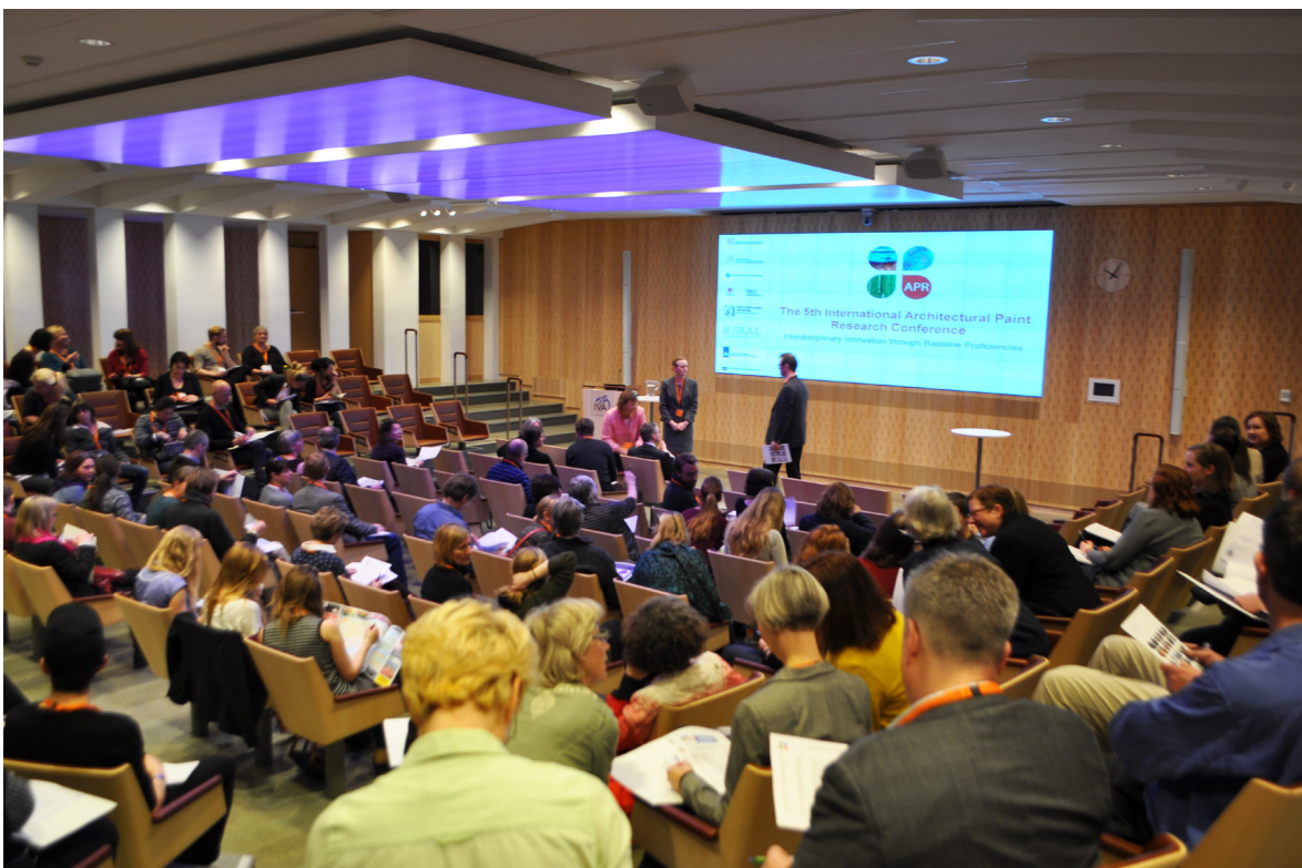
The conference hall, The Wallenberg Auditorium .

The resulting standards for architectural paint research that Historic New England developed outline the basic framework a consultant should use in creating a written report that will also be an effective management tool for the heritage manager. At the same time, Historic New England identified the areas of confusion a heritage manager might have when interpreting the results of an architectural paint research project. This paper explores these topics in an effort to assist both the creation and interpretation of architectural paint research.