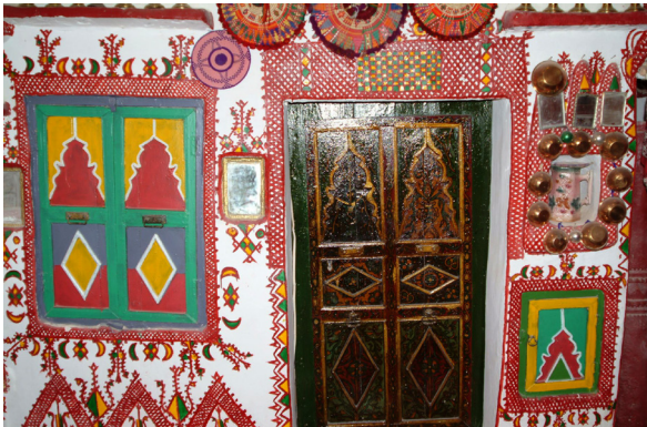
Interior Painting, Ghadames.

The heritage with its architectural Paint in the Sahara region is potentially one of the most attractive places in the world. The many oases and historic caravan towns across the