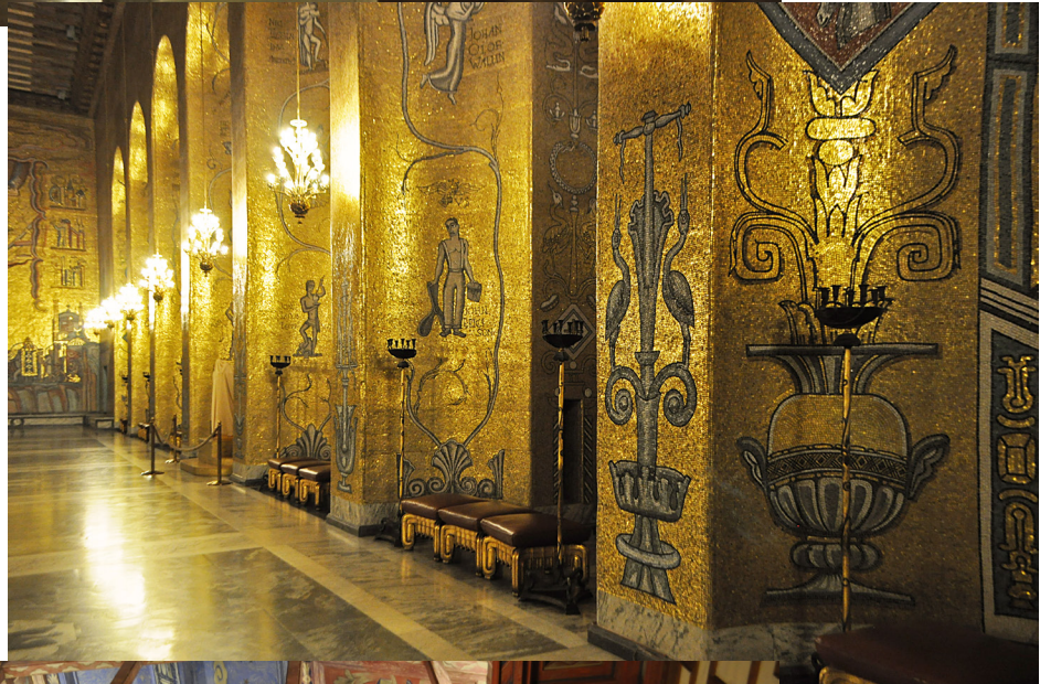
The City Hall of Stockholm: The Golden Hall