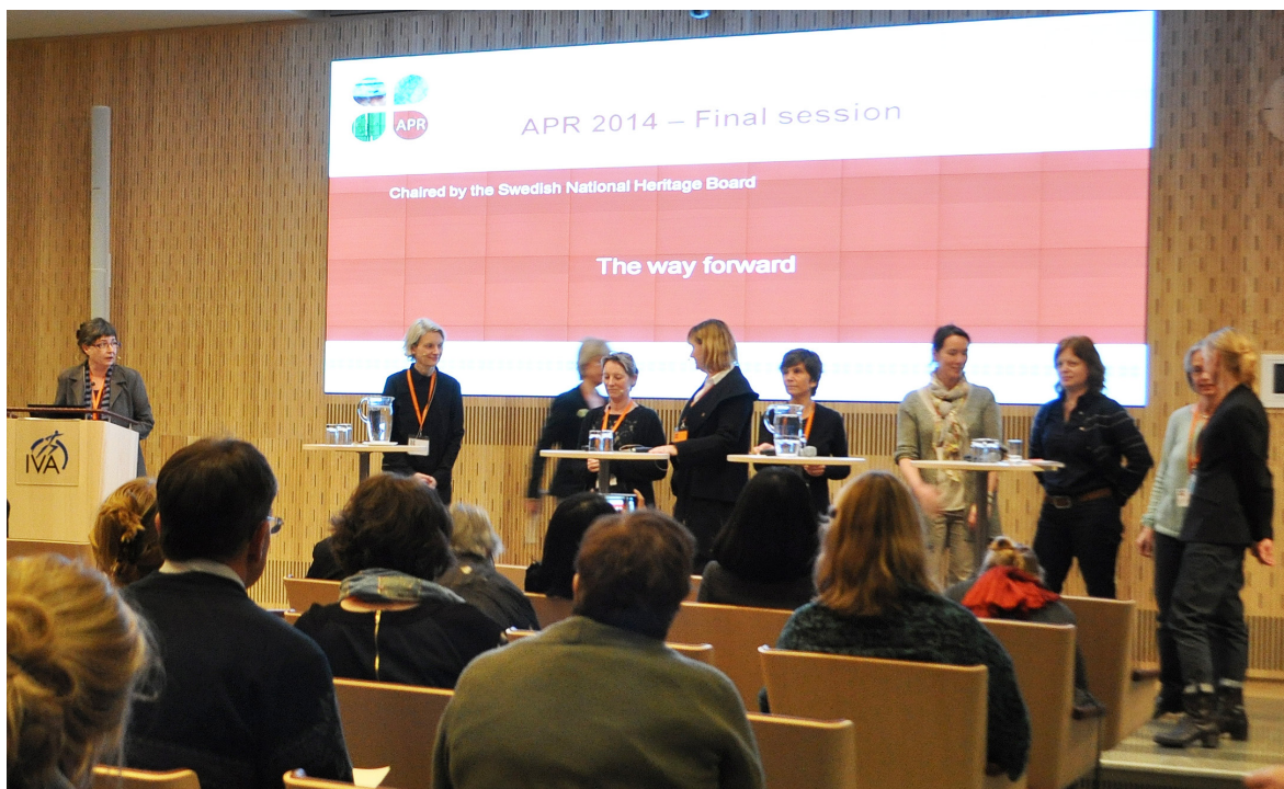
The panel discussion.

Returning to the question of how to promote APR, the idea of organizing an international association for APR practitioners (IAAPR) involving all related professions was put forth. Large and influential international organizations such as ICCROM and ICOMOS were mentioned as possible "umbrellas" to seek association with. ICCROM is currently preparing for a new program period aiming to enhance strategic issues. This could also help strengthen APR as it would connect us to a wider spectrum of heritage managers working at both the local and international level.