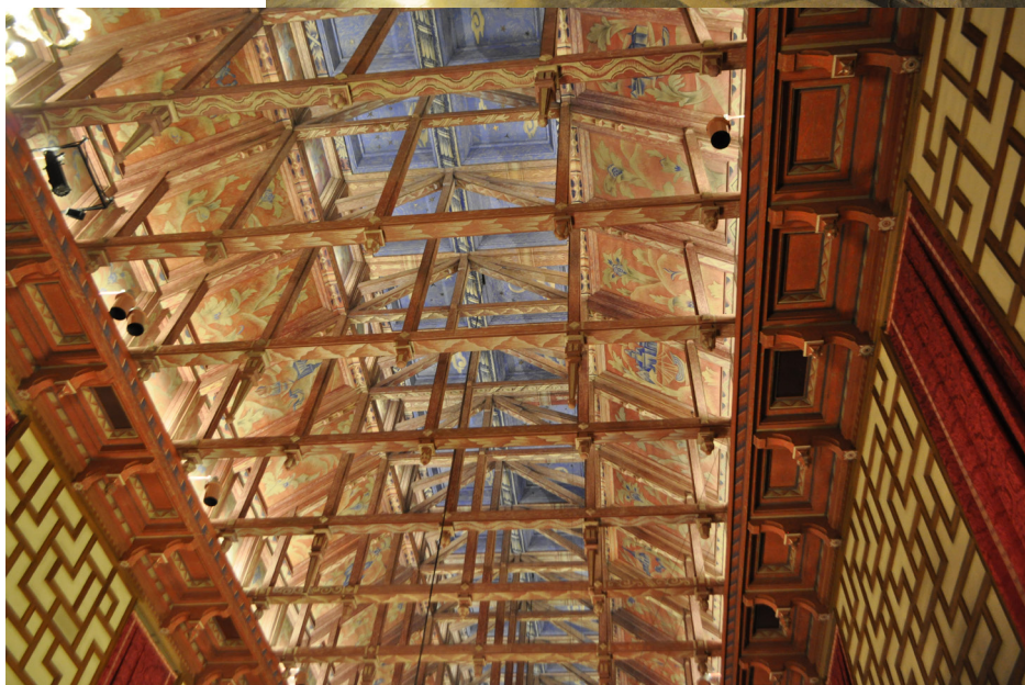
The City Hall of Stockholm: The Roof of the Council Hall.