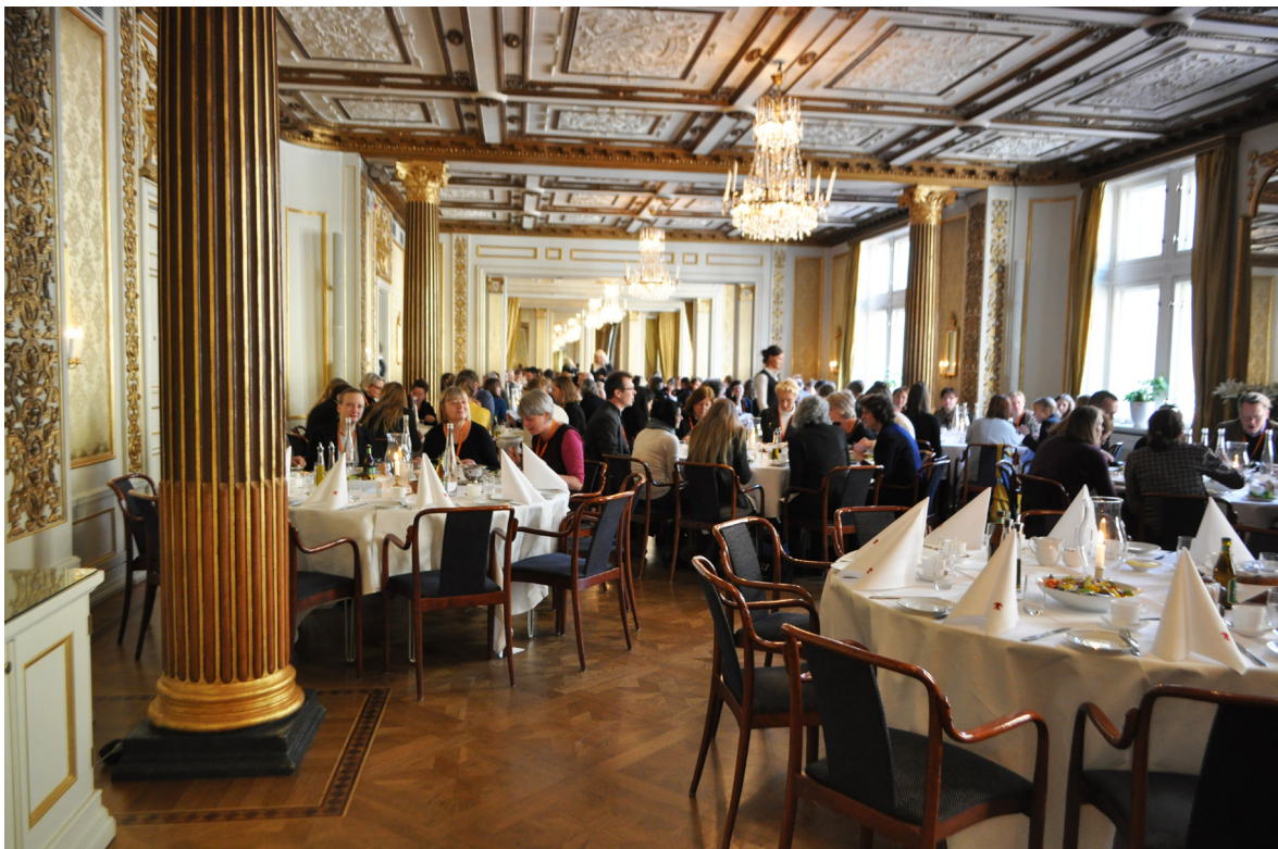
Luncheon in the Banquet Hall.

The architectural significance of colour expressed in paint and building materials should be explored more fully to engage stakeholders and encourage interdisciplinary communication between professionals. Architects and heritage professionals may be more inclined to consider architectural paint research when they are aware that colour is an indispensable part of architecture and part of the original design intent. To illustrate this point the architectural qualities of colour are explored and examined using three examples: the reintroduction of a dark brown colour on the window frames of the Royal Palace in Amsterdam, the reconstructed paint scheme in one of the interiors of The Maastricht Train Station (1915) and the paint research of the modernistic Tilburg Train Station dating from 1965.