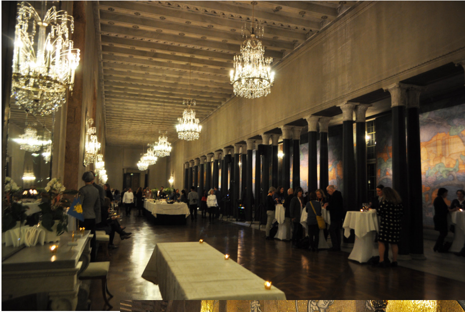
The City Hall of Stockholm: The Prince's Gallery.